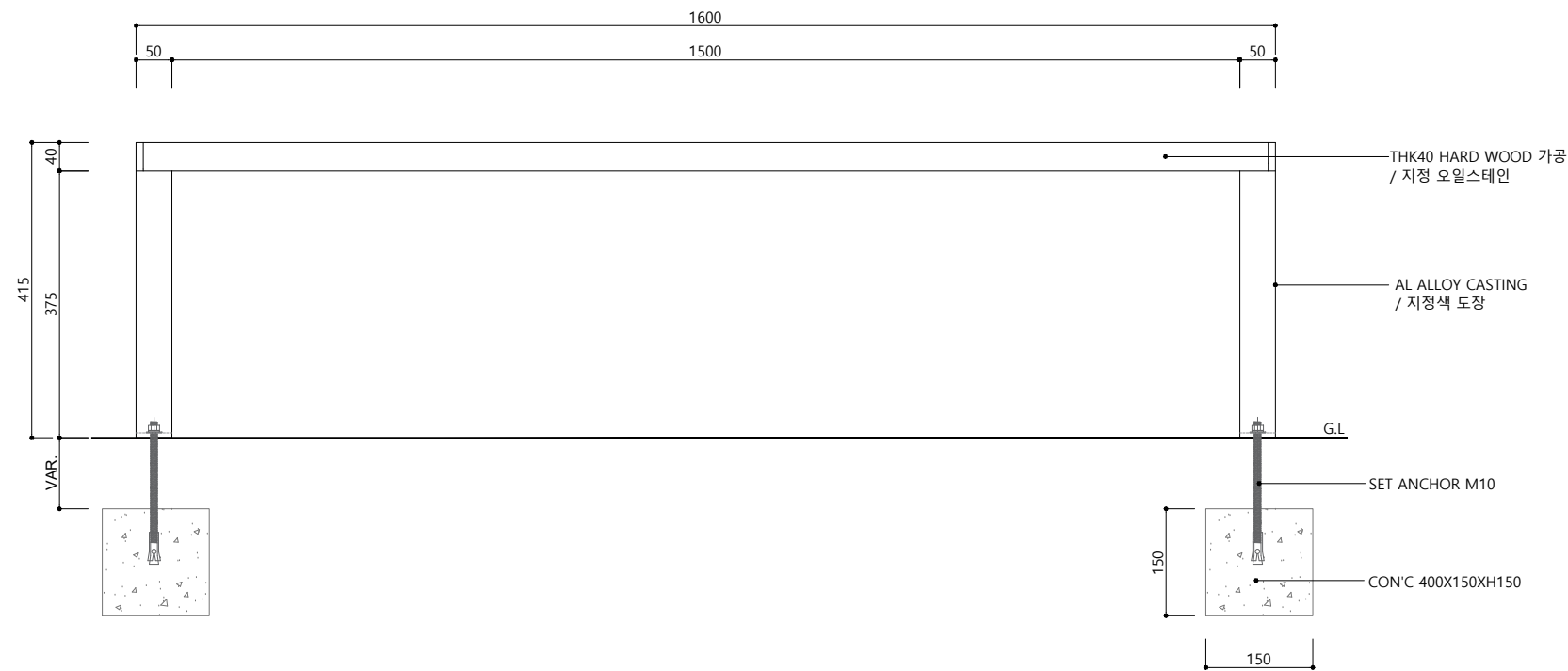
2 입면도 SCALE=A3 : 1/10